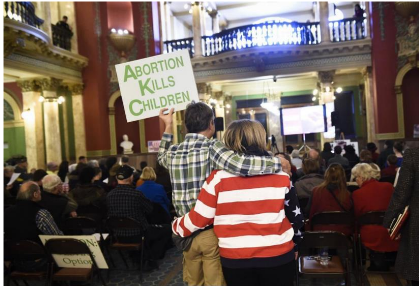
Capitol Rotunda

The Left's Crown Jewel Dominates in this election: