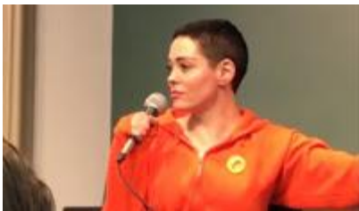
Rose McGowan, Transactivist

I can describe it, but I can't imagine what it is like. I do not experience it myself. Neither does the vast majority of the population — including the army of transactivists and social justice warriors who are pushing him to live as a woman. It is important to emphasize this point. Transactivists rarely suffer gender dysphoria themselves, nor do they represent people with gender dysphoria. Activists represent only activists.